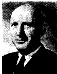
Sen. Richard B. Russell